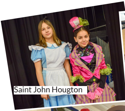
Saint John Houghton