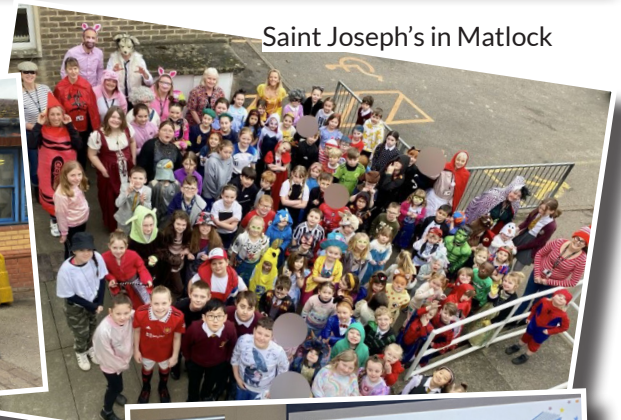
Saint Joseph's in Matlock